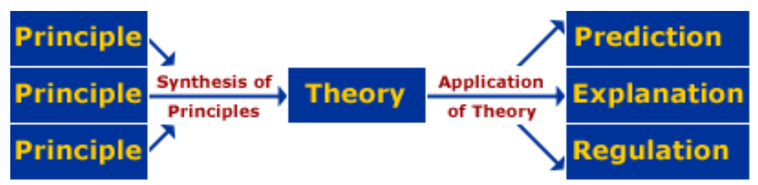
Figure 1. A theory is synthesized from principles of phenomena and seeks to inform the prediction, explanation, and regulation of those phenomena.

and describe the particular effects of these factors [on thought and behavior]" (Ormrod, 1999, p. 4). These principles are then meaningfully combined or synthesized to form a theory. The theory, however, is useless unless it can be applied through prediction, explanation, or regulation.